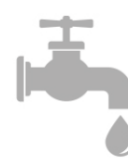
FAUCET & TAPS

Allow for the cleaned bathroom to dry for 10 minutes before entering again.