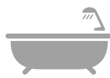
SHOWER & TUB